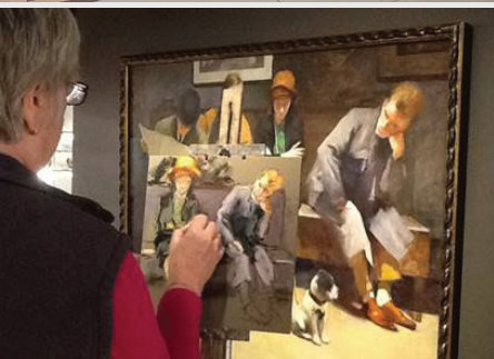
Peru Community Schools Fine Art Gallery