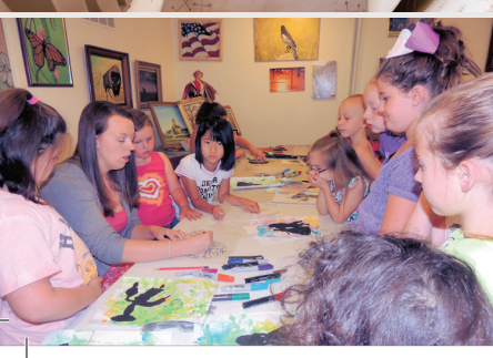
Miami County Artisan Gallery