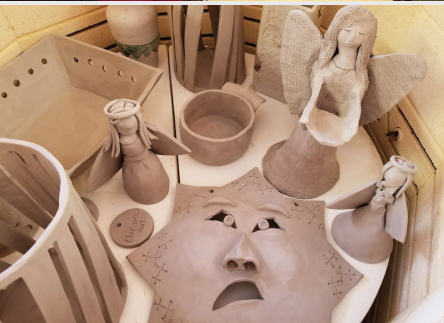
The Potter's Bench