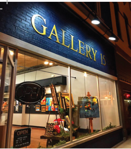
Gallery 15 & Studios LLC